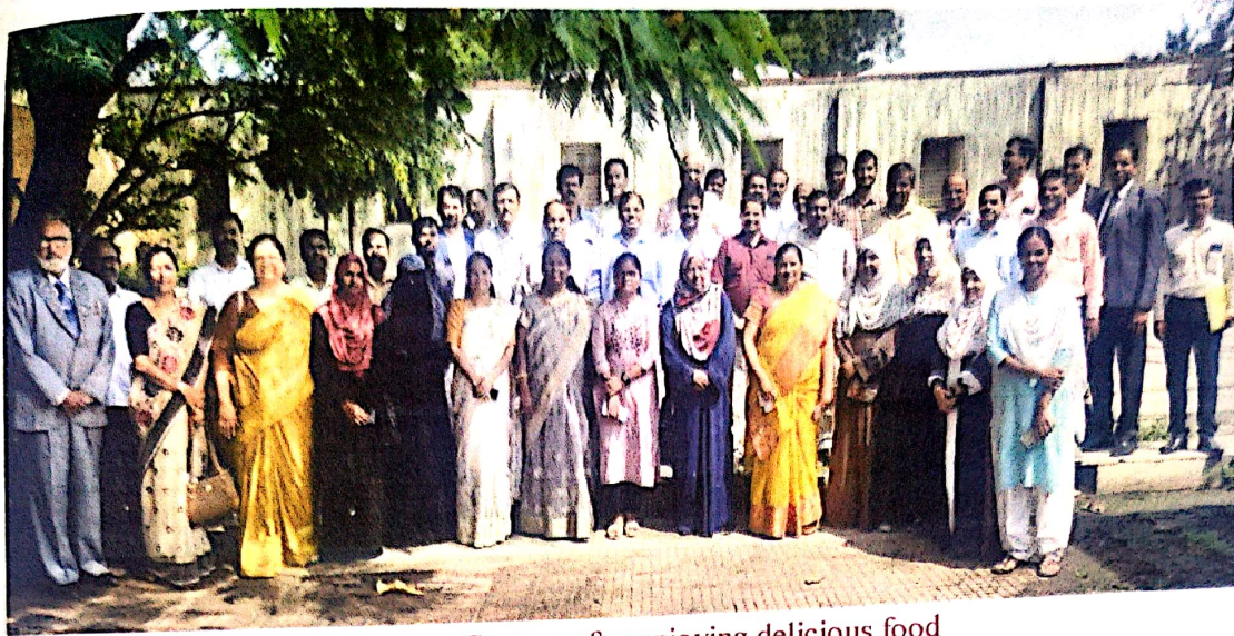
Participants at Canteen after enjoying delicious food