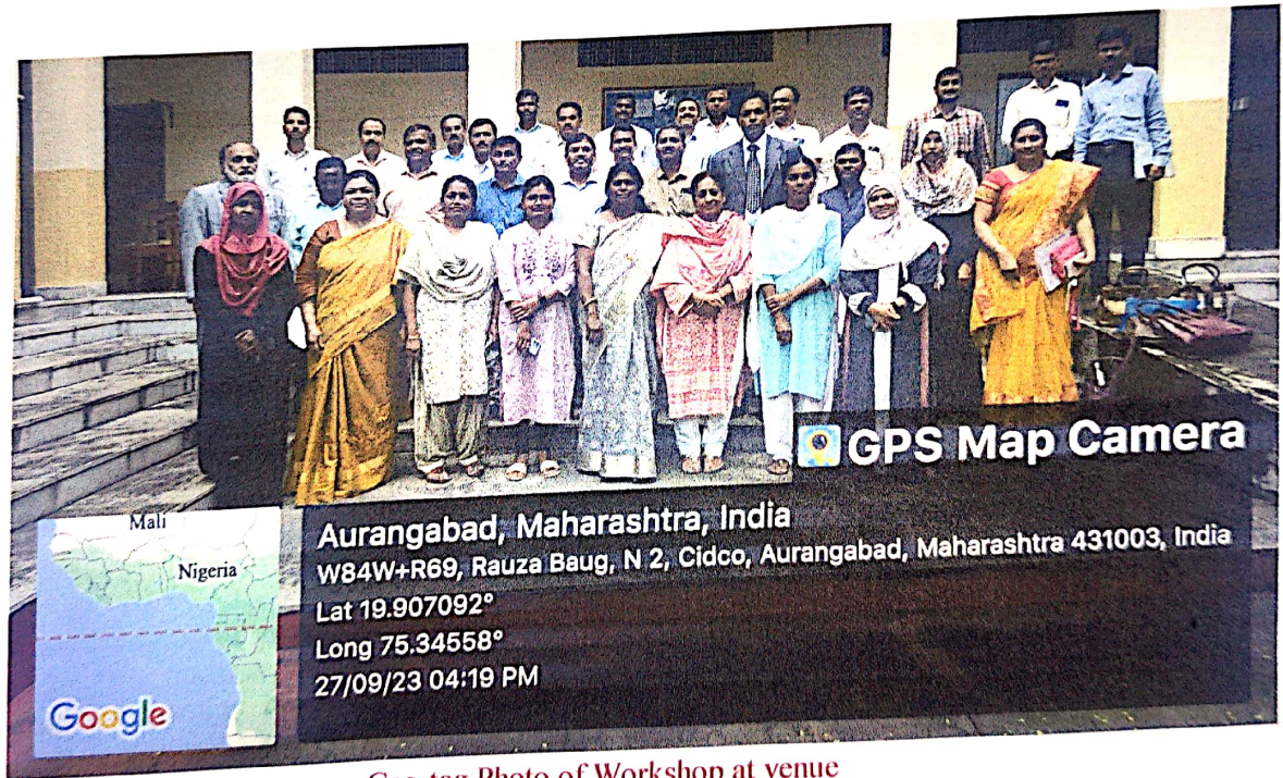
Geo-tag Photo of Workshop at venue