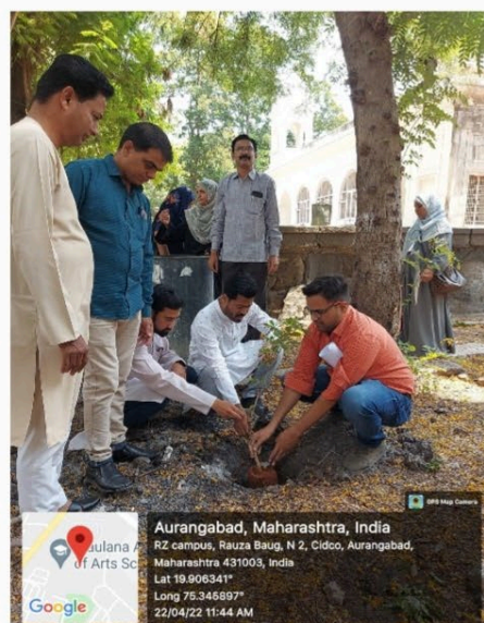
Tree plantation drives of the college