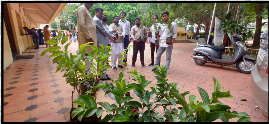
Tree plantations for Bee keeping - 11.02.2021