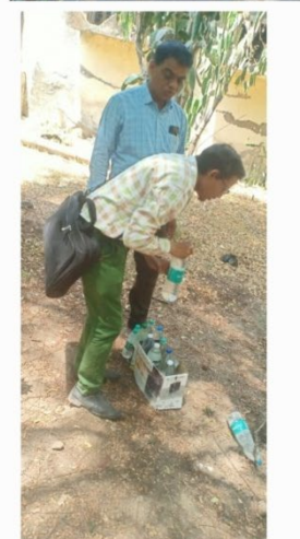
Bird houses and bottled watering of plants in summer season.