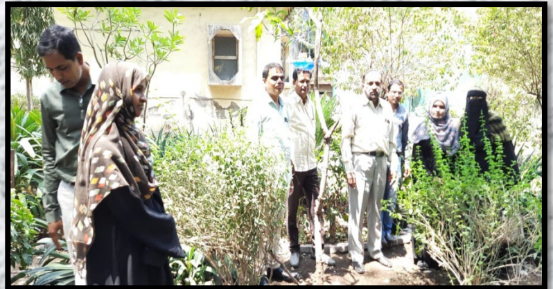
Bird houses being donated by faculty